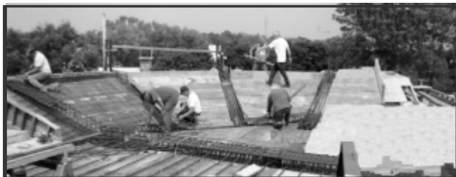
Volunteers Building Forms for Concrete

God bless the VOLUNTEERS that help with this work throughout the year!